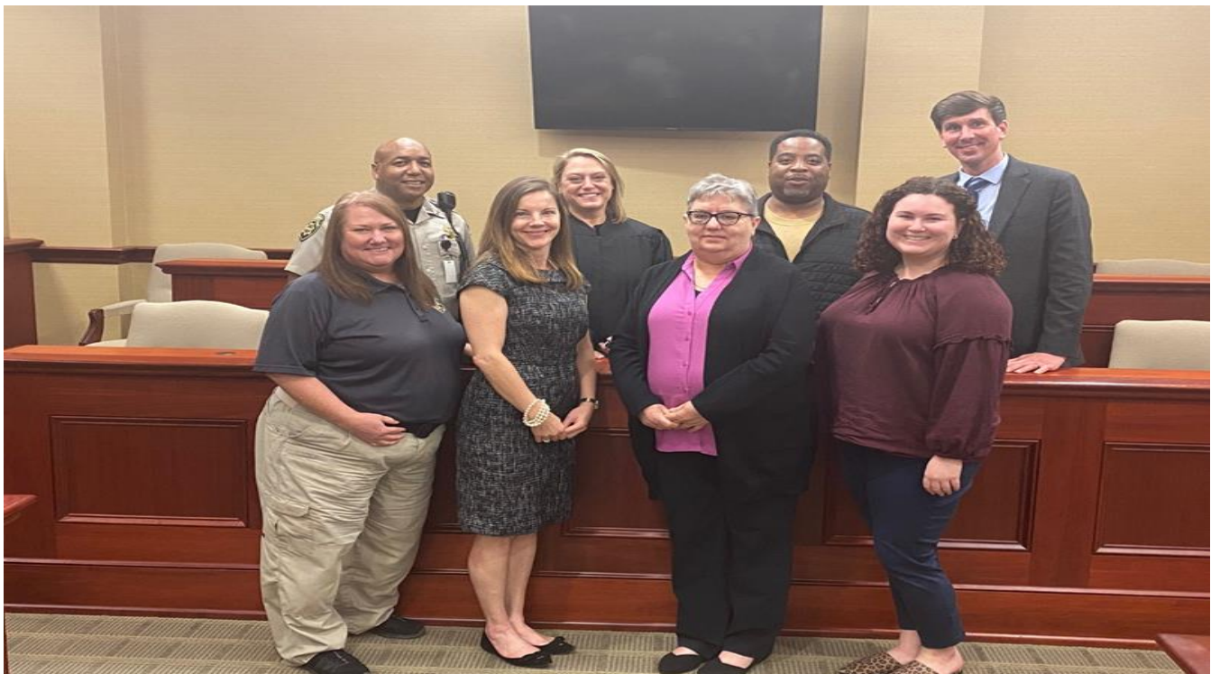
Model Adult Felony Drug Court (2020-2023)