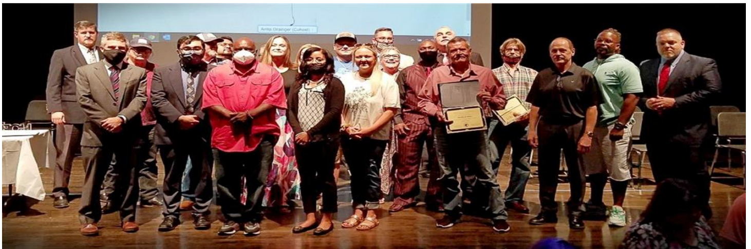
Pictured above are the graduates, guest speaker, and treatment court team.