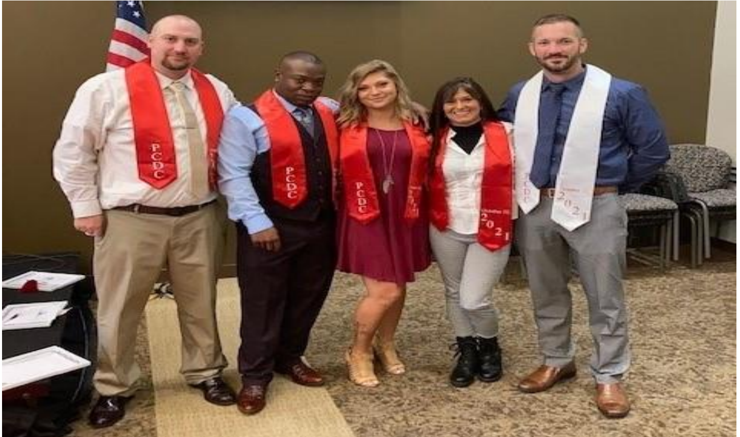
The Paulding County Judicial Circuit Drug Court hosted its 11 th graduation ceremony on October 22, 2021. Congratulations, graduates!